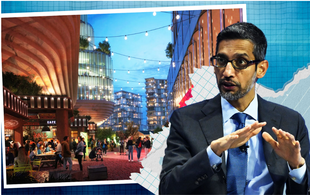
Google's Sundar Pichai with a rendering for Downtown West in San Jose

A developer met with city officials to discuss options for a former hardware store site