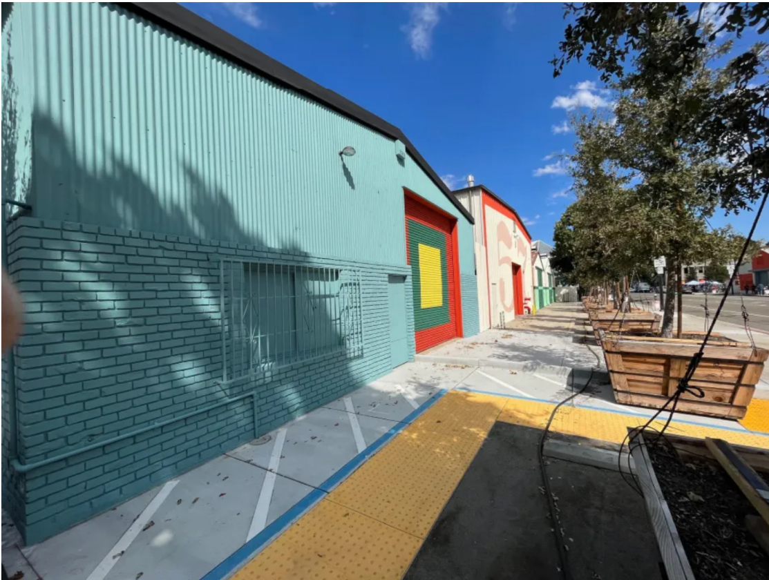
57 Barack Obama Boulevard in downtown San Jose, former site of the century-old Kearney Pattern Works and Foundry, seen in Sept. 2023.

Tech titan plans several strategies to make area more lively