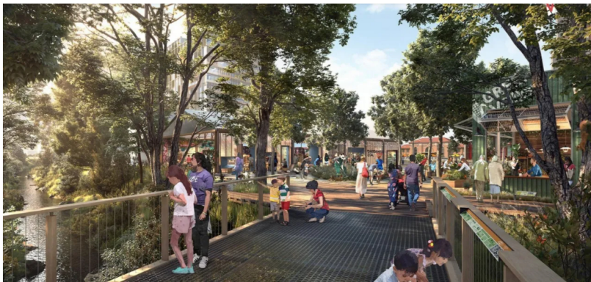
Creek bridge and nature areas near Diridon train station in Google's Downtown West project in downtown San Jose, concept.

SAN JOSE — Google is planning several "Creekside Socials" at locations within the footprint of the tech titan's proposed mixed-use transit village near Diridon Station in a push to create vibrant activity in downtown San Jose and the project site.