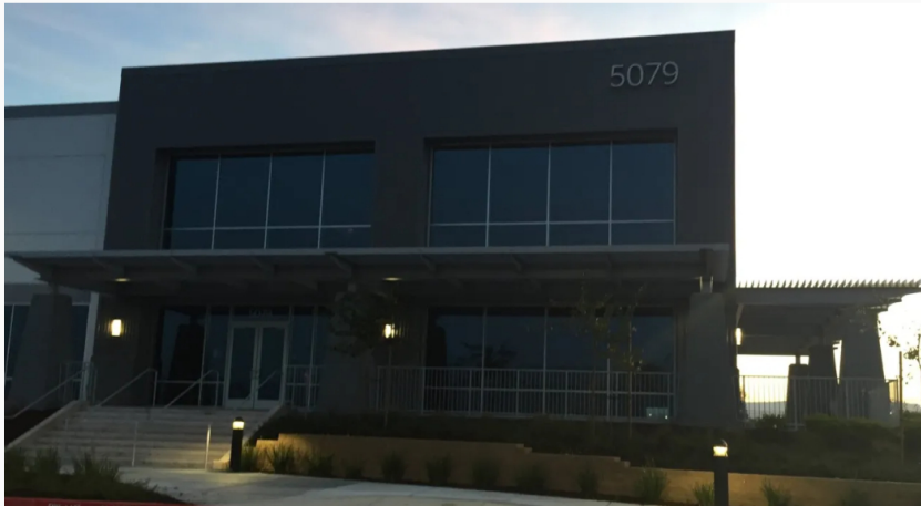
An advanced research and industrial building at 5079 Disk Drive in north San Jose's Alviso district, seen in 2018.

In 2018, the 5079 Disk Drive building became one of three huge industrial and advanced tech sites that Google bought through a $117.3 million all-cash purchase.