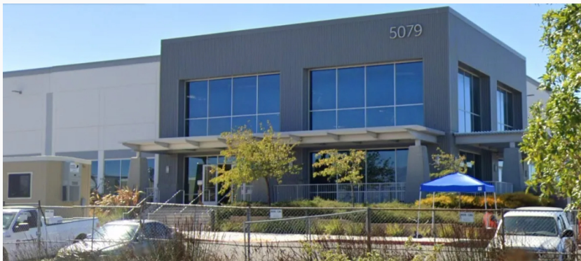
5079 Disk Drive, an advanced research and development building in north San Jose's Alviso district.

SAN JOSE — Google is taking early steps to establish an advanced research hub in San Jose, a move that broadens the tech titan's presence in the Bay Area's largest city.