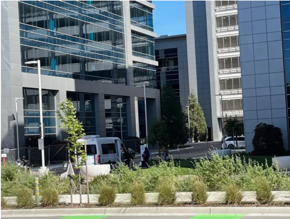
People board a shuttle bus at a Google tech campus on Brokaw Road between North First Street and Bering Drive in North San Jose, April 2023.

Signs on the campus featured an aviation theme, including images of a jetliner.