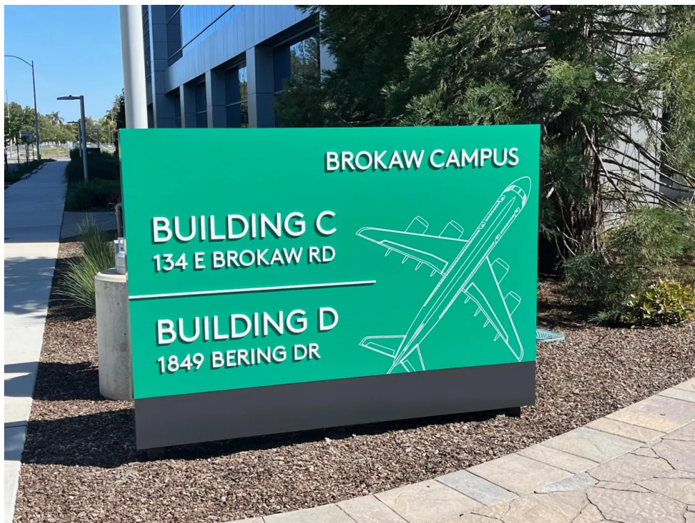
A sign in a tech complex that Google has named its Brokaw Campus, located on Brokaw Road between North First Street and Bering Drive in North San Jose.

PUBLISHED: April 27, 2023 at 7:10 a.m. | UPDATED: April 28, 2023 at 3:04 a.m.