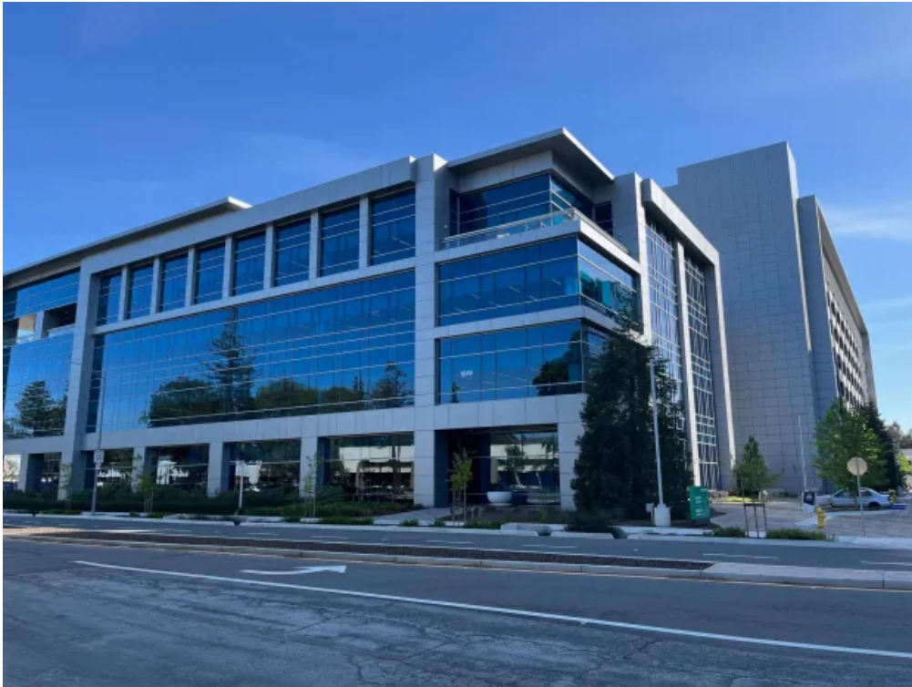
1849 Bering Drive in north San Jose, one of four office buildings in a Google tech campus.

The expansion comes at a time when uncertainties have emerged regarding when Google will launch the construction of a planned transit village next to the Diridon train station and SAP Center in downtown San Jose.