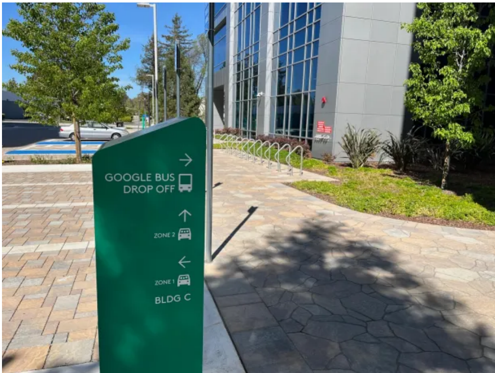
A sign providing directions on a Google campus on Brokaw Road between North First Street Bering Drive in North San Jose.

Now, the tech titan has occupied two of the large buildings on the site. The addresses are 122 East Brokaw Road and 1849 Bering Drive. A Google spokesperson confirmed the company’s occupancy of the two buildings.