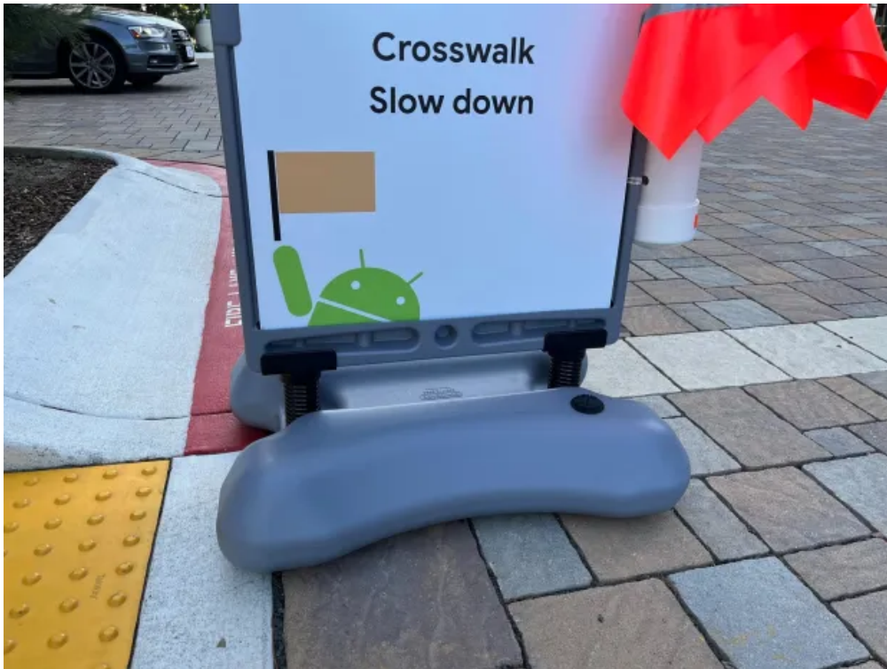
Android robot image is visible on a sign at a Google tech campus on Brokaw Road between North First Street and Bering Drive.

Google calls the new four-building complex the Brokaw Campus, as signs near the buildings suggest.