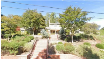
Single family residence sells for $4 million in Los Gatos