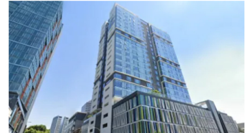
SUBSCRIBER ONLY Oakland housing tower is grabbed by lender over failed property loan