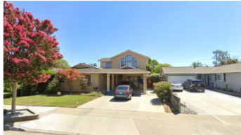
Single family residence in San Jose sells for $1.5 million