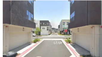
Condominium sells in San Jose for $1.1 million