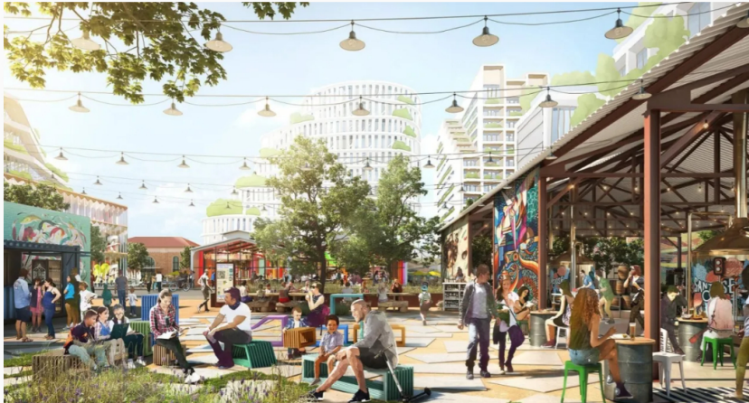
Autumn Street section of the Downtown West neighborhood in downtown San Jose proposed by Google, showing future buildings near the Diridon train station, concept. //

Google says that it hopes to break ground on the first new buildings in 2023 and that it is aiming to launch the construction of streets and other crucial infrastructure in 2022.