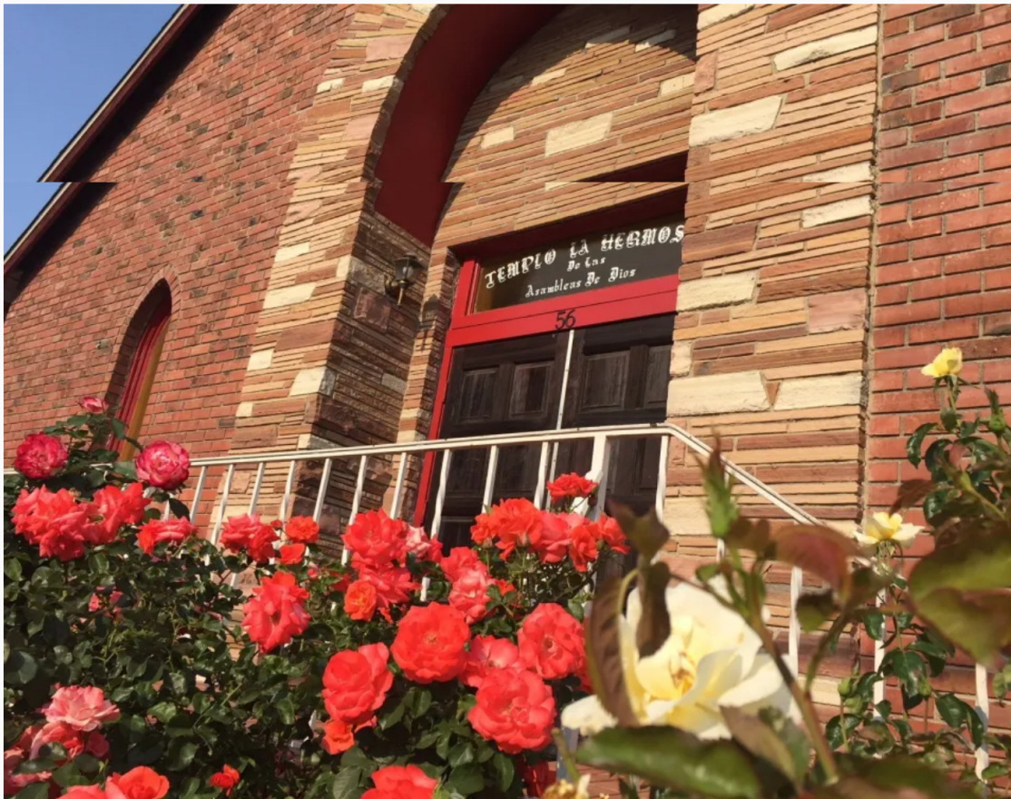
Front entrance of Templo La Hermosa at 56 S. Montgomery St. in downtown San Jose. Google and its development ally have struck a deal to buy a church property on what is shaping up to be one of the key blocks that would be needed for the tech titan's proposed transit village in downtown San Jose.

Tech titan buys site across from downtown San Jose train station