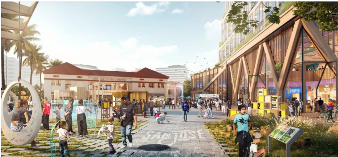
(SITELAB urban studio, Google)

One building is completely removed as Google pushes ahead on new neighborhood